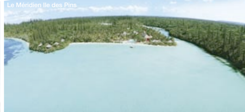
Le Méridien Ile des Pins