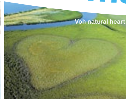
Voh natural heart